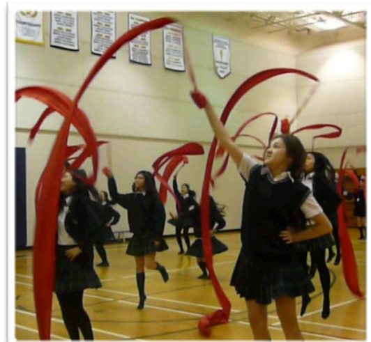
Ribbon dance at a lunch celebration event.