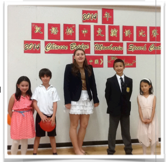
Mulgrave School students.