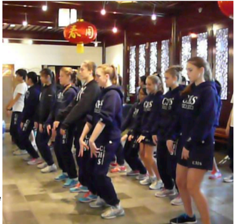
Grade 9 students had a taste of Taiji in the beautiful Dr. Sun Yat-Sun's Classical Chinese Garden.