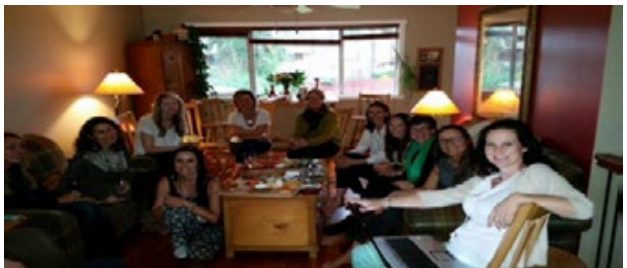
Kelowna teachers tweeting on May 6!

Enjoy the rest of this newsletter and may it inspire you for the coming school year!