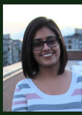
Summet Playia Core French Rep